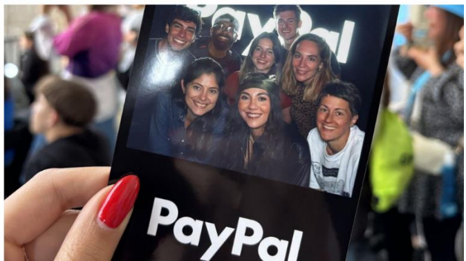
PayPal and Venmo brand activations at the Lollapalooza festivals in Chicago and Berlin.