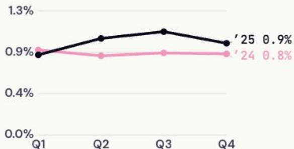
CHARGE CARD EQUIVALENT / PAY LATER — 60+ DPD