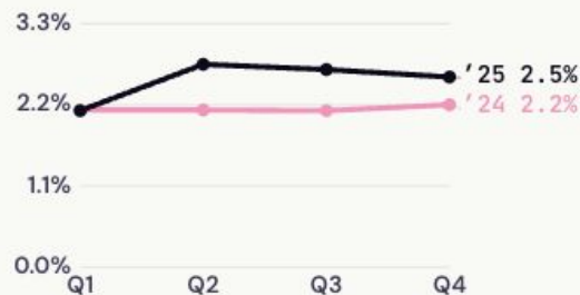
POINT OF SALE INSTALLMENTS / FAIR FINANCING — 30+ DPD