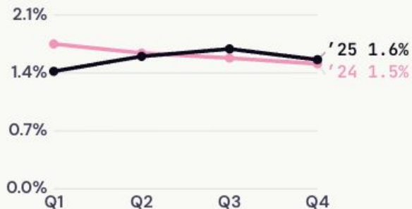
CHARGE CARD EQUIVALENT / PAY LATER — 30+ DPD